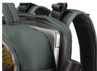
Can fit up to 14inch laptop