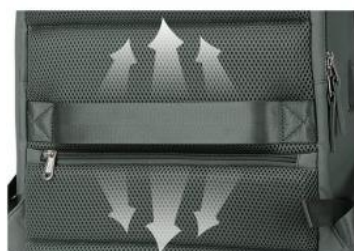
Relieve stress of your shoulder