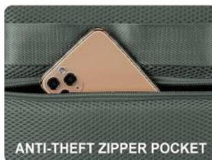
ANTI-THEFT ZIPPER POCKET