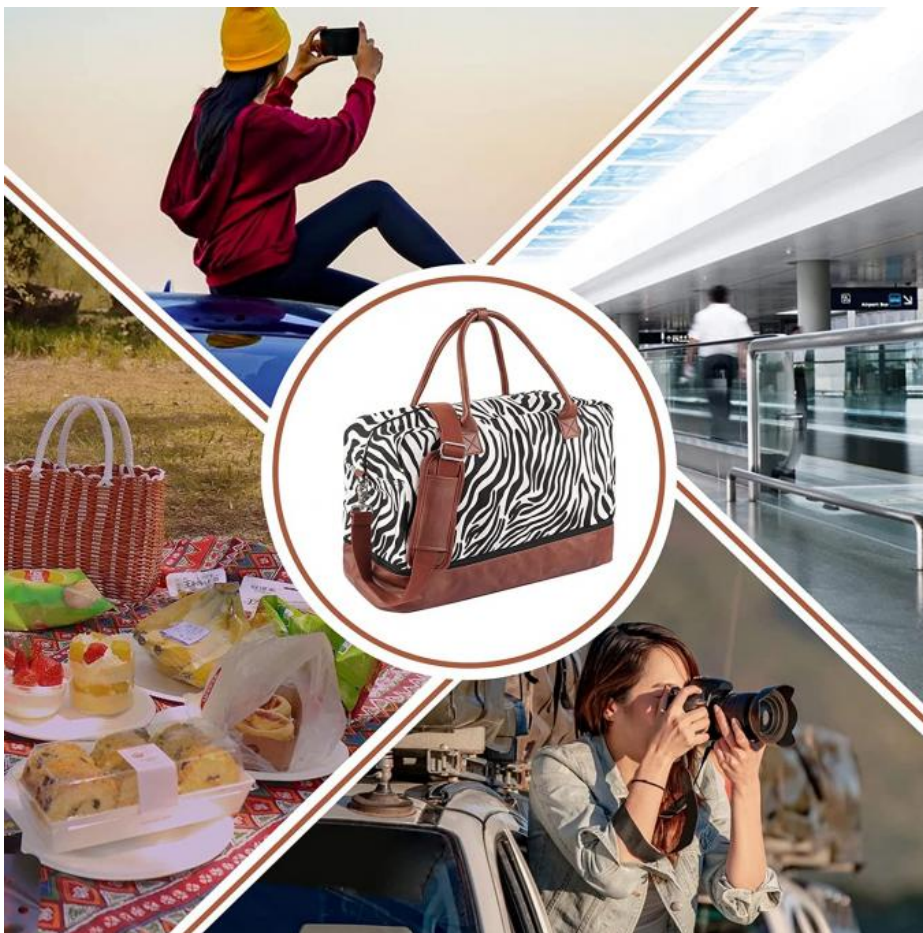
1) Duffle Bag Color Options :