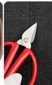
4.Wear-resistant canvas fabric