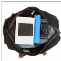
Internal capacity display