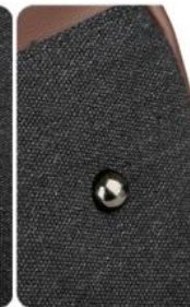
5.Bottom anti-wear rivet design