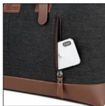
Side zipper pocket design