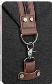
2.Shoulder strap sturdy hook connection