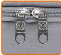
METAL DEBOSSED ZIPPER PULLER