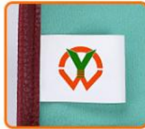
WASHING CARE LABEL