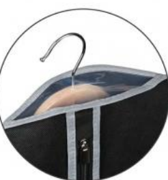
Dust Proof PVC Design