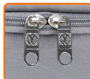
METAL DEBOSSD ZIPPER PULLER