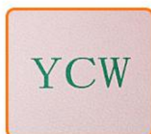
SILK SCREEN PRINTING