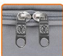
METAL DEBOSSD ZIPPER PULLER